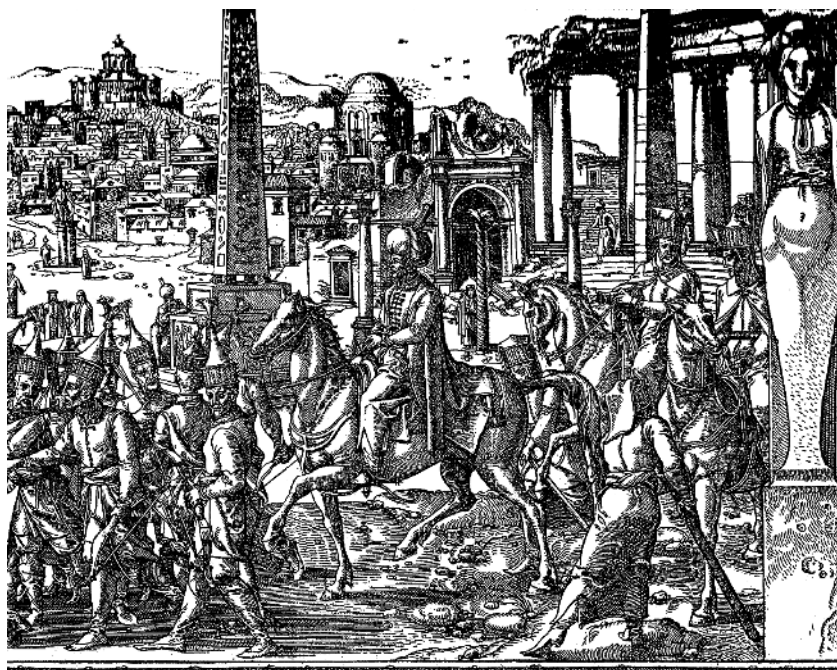
Figure 8.1 Süleyman in procession through Istanbul, c.1533. From Pieter Coecke van Aelst, The Turks in MDXXXIII: a series of drawings made in that year at Constantinople by Peter Coeck of Aelst, and published from woodblocks, by his widow, at Antwerp in MDLIII ; reproduced in facsimile (London, 1873) and as Gravürlerle Türkiye I (Ankara, 1996), plate 113.

Protestant preacher who spent four years from 1577 to 1581 in Istanbul as part of the entourage of the Habsburg envoy, heard about Murad's disease ( fallende Krankheit ). 4 Aside from his failure to attend a single campaign, Murad did not leave the palace during the last years of his reign. For two consecutive years he failed even to attend the Friday procession to an imperial mosque, a unique occurrence in the Ottoman throne city. According to the historian Selaniki (d. 1600), a vigilant observer of late sixteenth-century events, whenever Murad wanted to go out for the Friday prayer, he was frightened into changing his mind by allusions to an alleged plot by the Janissaries to dethrone him when he left the palace for that purpose. 5 Selaniki's explanation for Murad's resistance to going on campaign also cites more directly the strained relations between the sultan and the Janissaries, recounting that the latter several times made bold demands of the sultan personally at the imperial council. As a result, Murad did not trust the Janissaries to support him in the tensions that were likely to arise during a campaign. 6