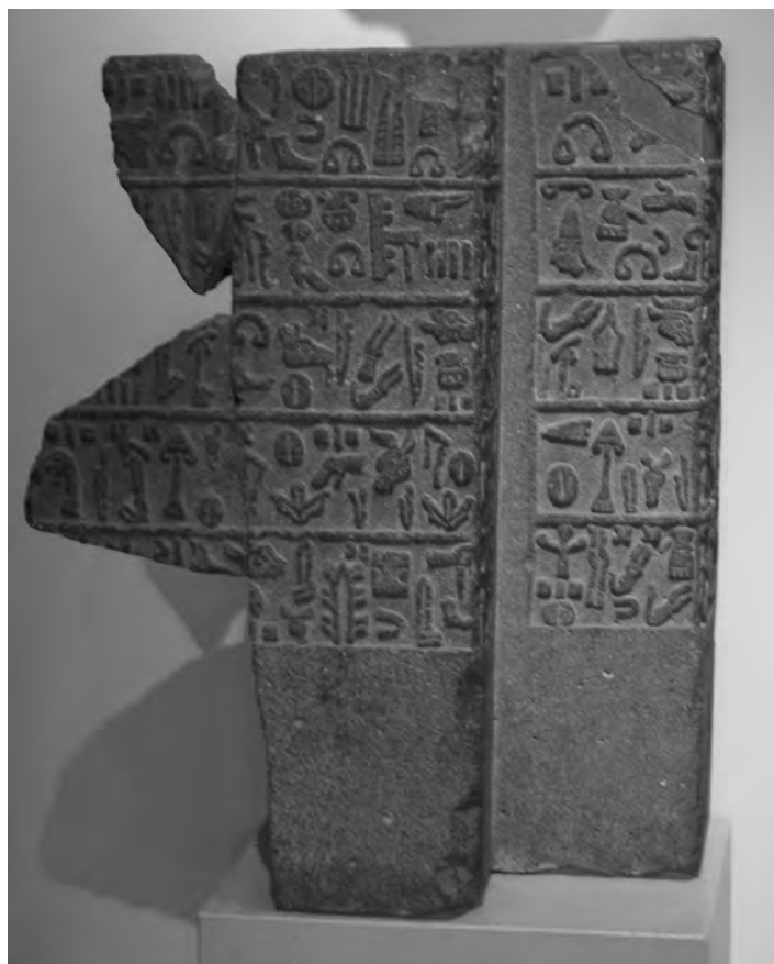
Figure 26 Inscription of Katuwas, Neo-Hittite king of Carchemish.

68–9, 108–9). But in 717, during the reign of Sargon II, he was accused by his Assyrian overlord of communicating, presumably with a view to forming an alliance, with the Phrygian king Mita (Greek Midas). Sargon attacked and captured Carchemish, took Pisiris and his family and leading courtiers back to Assyria as captives, and stripped the land of its wealth (*ARAB II: 4, *CS II: 293). Carchemish then came under the direct control of the Assyrian administration, as a province ruled by an Assyrian governor.