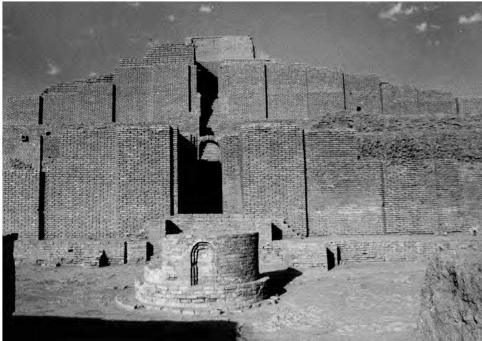
Figure 31 Chogha Zanbil.

There are two main sections of the site. The first consists of a temenos, or sacred walled precinct, containing a number of temples, and in the centre of the complex a square-based ziggurat made of baked and sun-dried bricks, and enclosed within a wall of its own. Originally, the building was a single-level structure with rooms surrounding an open sunken courtyard, which was accessed by monumental gateways in the middle of each of three of its 100 m long sides. The gateways were guarded by bulls and winged griffins made of glazed terracotta. The building was transformed into a ziggurat (see glossary) in a subsequent building phase when a tower consisting of three concentric levels was erected in the central courtyard, to a total estimated height of c. 12 m. On top of the uppermost level, a high temple was constructed. It had a facing of blue-, green-, gold- and silver-coloured glazed bricks, and was accessed from ground level by a series of staircases. Called the kukunnum , it was dedicated to two deities – Inshushinak and Napirisha, originally the chief gods of Susa and Anshan respectively. The other temples within the precinct were dedicated to a wide range of Elamite, Susian, and Mesopotamian deities, as attested in the inscriptions found on the site. Up