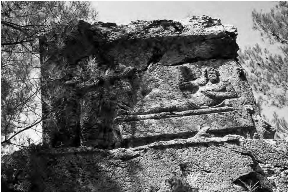
Figure 24 Tomb with relief, Cadyanda.

Bean (1978: 42–5, PECS 429–30), Wörle ( BNP 2: 870).