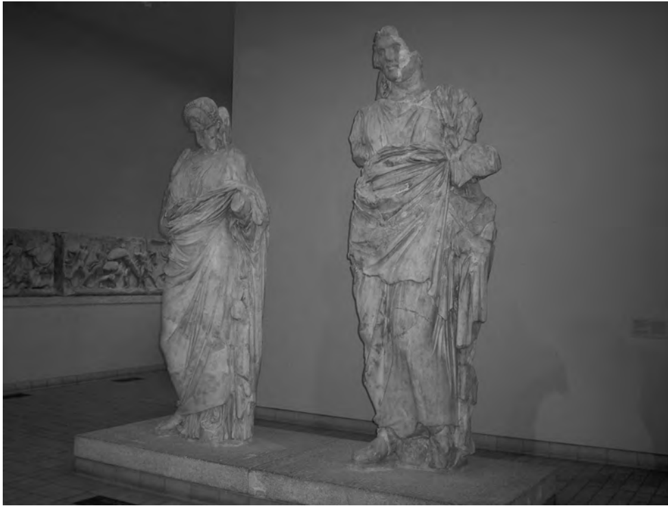
Figure 29 Mausolus and his sister/wife, Artemisia.

progressed substantially in C4, under the Persian-backed Hecatomnid dynasty, most notably during the rule of Mausolus (377–353), who styled himself Persian satrap in his inscriptions. Mausolus played an important role in the spread of Greek influence through Caria, but was also concerned to preserve elements of the indigenous culture of the region.