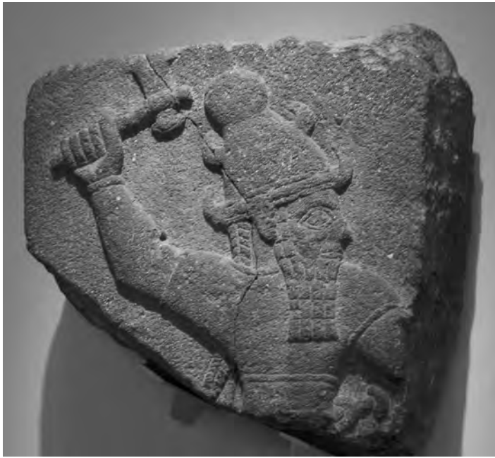
Figure 28 Storm god, Carchemish.

period. The name Caria, attested in Classical sources, may be etymologically linked with Karkisa, the name of a Late Bronze Age country in western Anatolia (whose precise location is uncertain), attested in Hittite texts. According to a tradition recorded by Herodotus (1.171), the Carians were immigrants to western Anatolia from the Aegean islands, displaced from their original homelands by Ionian and Dorian Greeks. If so, they may have participated in the general migratory movements to the coastlands of western Anatolia in late M2. But Herodotus notes that the Carians themselves claimed that they were native Anatolians, and had always been called Carians. This claim would be compatible with the proposed etymological link between the names Caria and Late Bronze Age Karkisa. It might also be supported by Homer's description of the Carians in the Iliad (2.867) as 'speakers of a barbarian language' – a description which clearly distinguishes them from immigrant Greeks. I. Yakubovich (2008) has recently proposed that the political unification of the region in western and southwestern Anatolia called Arzawa in Late Bronze Age Hittite texts was the achievement of Proto-Carian groups who provided the ruling aristocracies in the region. He argues against the common assumption that Arzawa was inhabited and ruled by Luwian-speaking peoples.