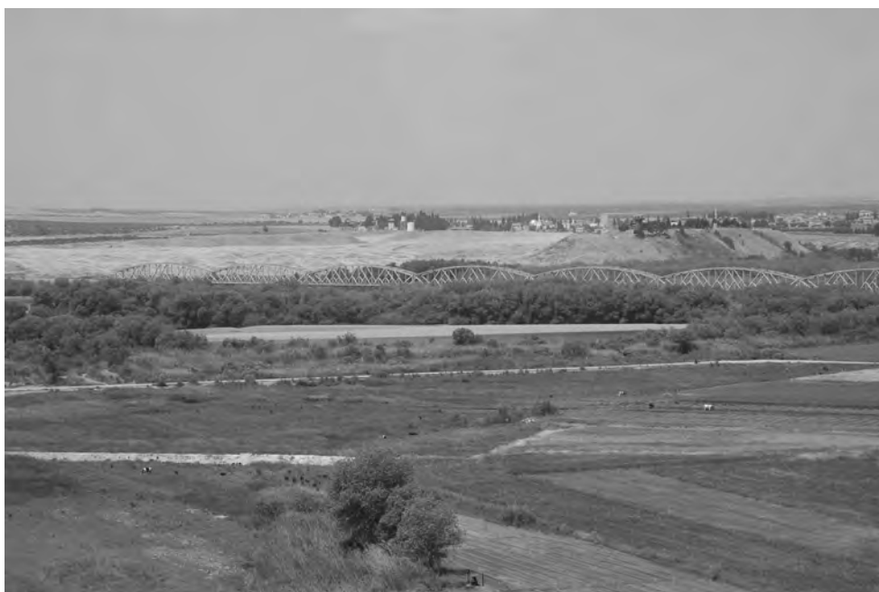
Figure 25 Environs of Carchemish.

to have played the more important military, political, and judicial roles in the Syro-Palestinian region, virtually with the status of a regional overlord. The death of Sharri-Kushuh c. 1313, when the Hittite throne was occupied by the viceroy's brother Mursili II, prompted the Assyrians to invade and occupy Carchemish, until they were driven from the land by a Hittite military force under Mursili's personal command (*AM 116–19). Before returning home from Syria, Mursili installed Sharri-Kushuh's son Shahurunuwa on the throne of Carchemish (*AM 124–5). Two decades later, the Assyrian king Adad-nirari I (1307–1275) claimed Carchemish amongst his extensive conquests (*RIMA 1: 131). But the Assyrians failed to make any lasting impact on the city or its associated territories, which appear to have remained fairly firmly under Hittite control until the end of the Bronze Age.