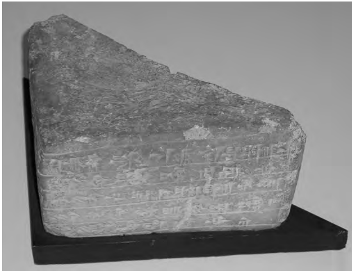
Figure 32 Chogha Zanbil, inscription on baked brick.

Artefacts unearthed from various locations on the site include the glazed terracotta