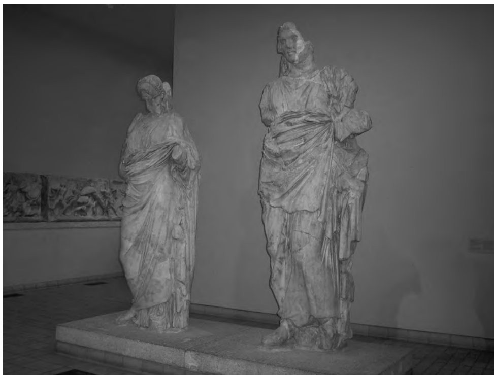
Figure 29 Mausolus and his sister/wife, Artemisia.

progressed substantially in C4, under the Persian-backed Hecatomnid dynasty, most notably during the rule of Mausolus (377–353), who styled himself Persian satrap in his inscriptions. Mausolus played an important role in the spread of Greek influence through Caria, but was also concerned to preserve elements of the indigenous culture of the region.