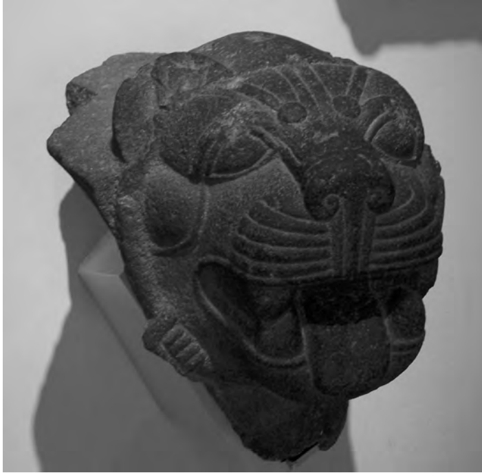
Figure 27 Lion head, Carchemish (C9).

Age date are the meagre remains of a building on the citadel mound, conjecturally identified, without evidence, as those of the temple of Kubaba, the city's chief deity. More substantial remains of the Neo-Hittite city were uncovered within the inner city wall – most notably, the sculpted and inscribed exterior façades (mainly relief orthostats and dedicatory inscriptions) of the temple of the storm god, the gatehouse and great staircase leading up to the citadel, the so-called herald's wall, the processional entry (later modified by an addition called the royal buttress), and the king's gate. These monuments all date within the period from early M1 to the Assyrian takeover in 717. Both the sculptures and the inscriptions (in Luwian hieroglyphs) provide information about two successive ruling dynasties in this period, founded respectively by Suhis I (c. 950) and Astiruwas (c. 850).