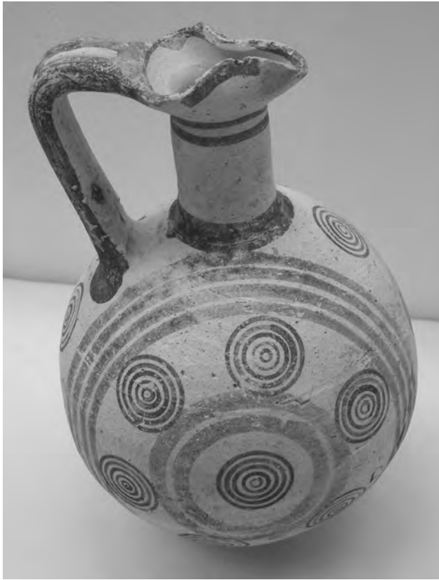
Figure 33 Cypriot oinochoe (C7).

beginning of C5, Darius firmly reasserted his control over the island after the abortive attempt by all but one of its kingdoms to throw off the Persian yoke by joining the Ionian revolt in 499 under the leadership of Onesilus, king of Salamis. Amathus alone remained loyal to the Persians. (Muhly suggests that the island was divided between pro-Greek and pro-Persian camps.) Though Cyprus remained under Persian rule for much of C5 and C4, up to its conquest by Alexander the Great in 330, the island became a battleground several times in this period between Greek and Persian forces. Diodorus (16.42, 46) also reports an island-wide and ultimately unsuccessful rebellion against the Persian king Artaxerxes III (359–338). Yet in spite of Persian political and military dominance, Cyprus demonstrated an increasingly Greek cultural orientation from mid M1 onwards. And the island's system of individual monarchies remained largely undisturbed until Ptolemy I Soter conquered the island in 294 and abolished all its monarchies, except for the one installed at Soli.