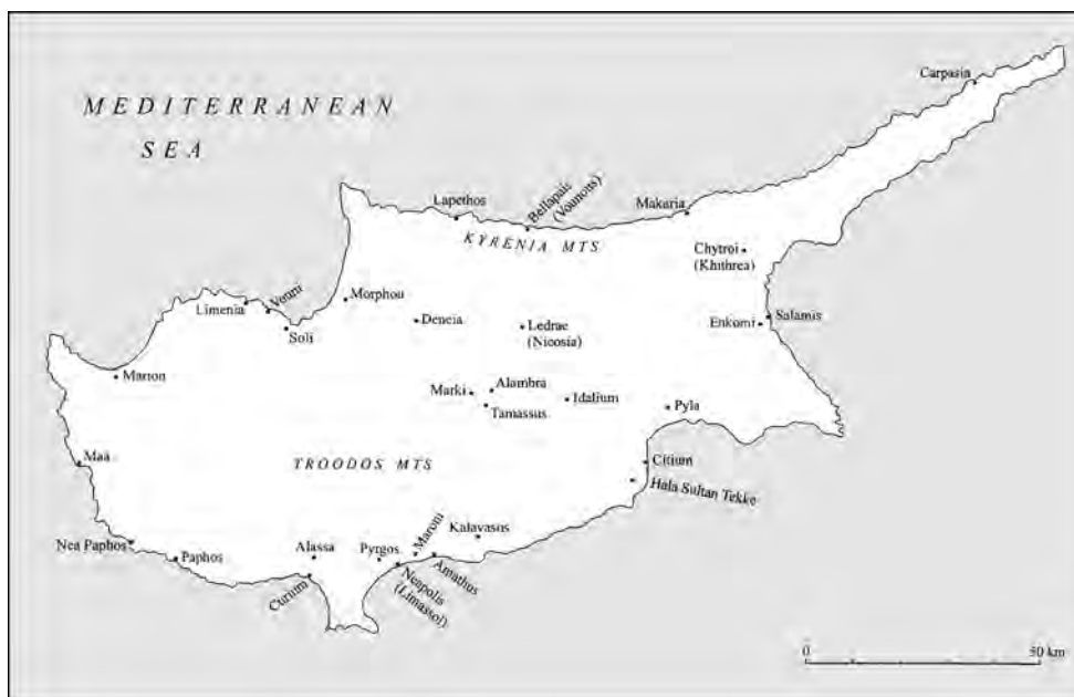
Map 14 Cyprus.

discharged their merchandise at many trading emporia along the Egyptian, Anatolian, Levantine, and Aegean littorals. Timber also played an important role in the island's economy, both for local building activities and for export.