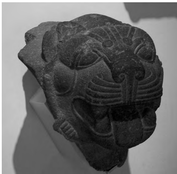
Figure 27 Lion head, Carchemish (C9).

Age date are the meagre remains of a building on the citadel mound, conjecturally identified, without evidence, as those of the temple of Kubaba, the city's chief deity. More substantial remains of the Neo-Hittite city were uncovered within the inner city wall – most notably, the sculpted and inscribed exterior façades (mainly relief orthostats and dedicatory inscriptions) of the temple of the storm god, the gatehouse and great staircase leading up to the citadel, the so-called herald's wall, the processional entry (later modified by an addition called the royal buttress), and the king's gate. These monuments all date within the period from early M1 to the Assyrian takeover in 717. Both the sculptures and the inscriptions (in Luwian hieroglyphs) provide information about two successive ruling dynasties in this period, founded respectively by Suhis I (c. 950) and Astiruwas (c. 850).