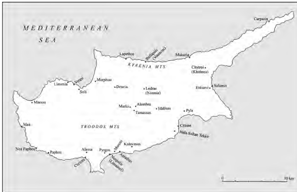
Map 14 Cyprus.

discharged their merchandise at many trading emporia along the Egyptian, Anatolian, Levantine, and Aegean littorals. Timber also played an important role in the island's economy, both for local building activities and for export.