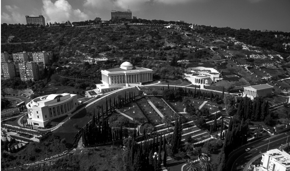
Figure 35.1 An aerial view of the Arc, the principal institutions of the Bahá'í World Centre, Haifa, Israel. Left to right: the International Teaching Centre, the Seat of the Universal House of Justice, the Centre for the Study of the Sacred Texts, and the International Bahá'í Archives. Behind the last two are the upper terraces that stretch from the bottom of Mount Carmel to the summit.