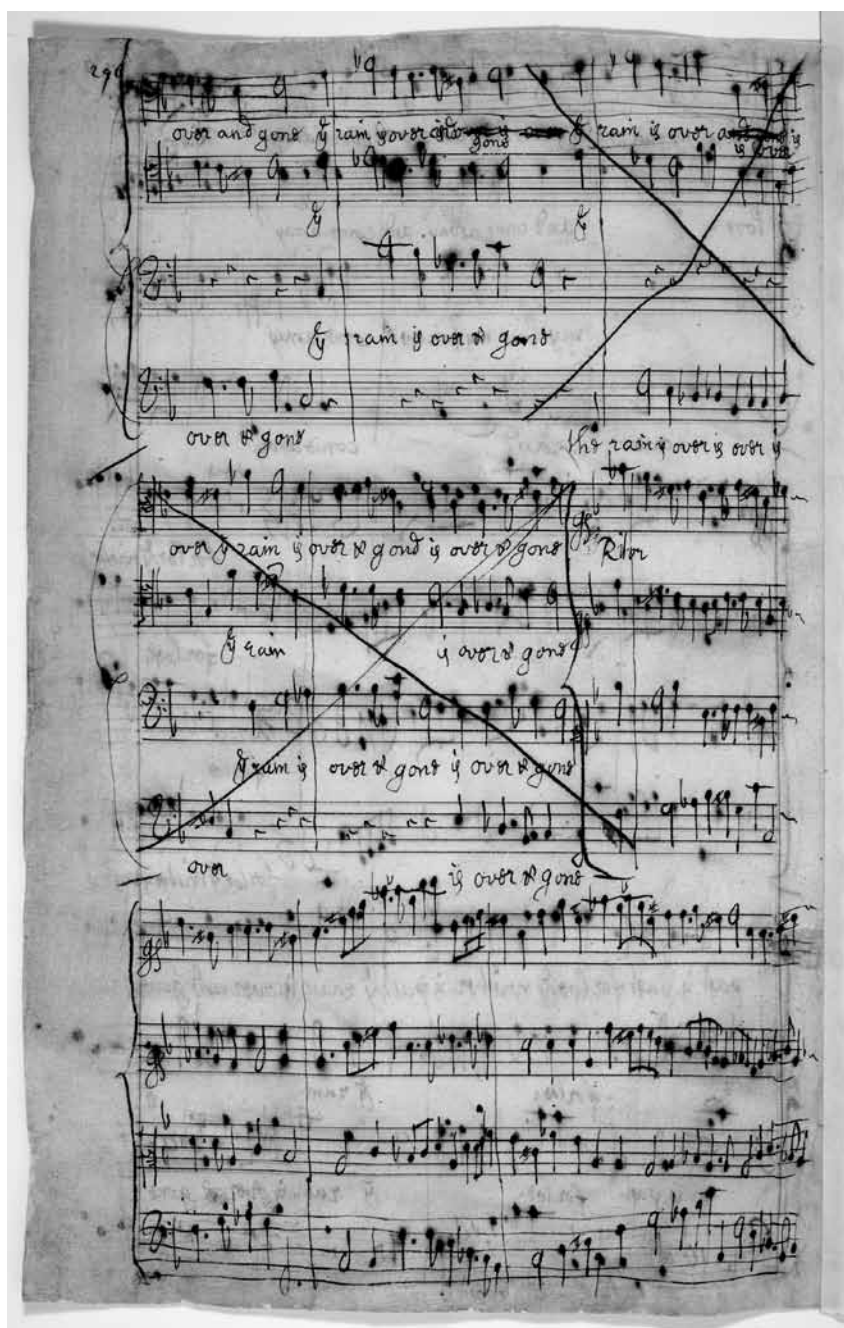
Figure 3.1 Purcell's alterations in his autograph score of My Beloved Spake , Lbl Add. 30932, fol. 88v.