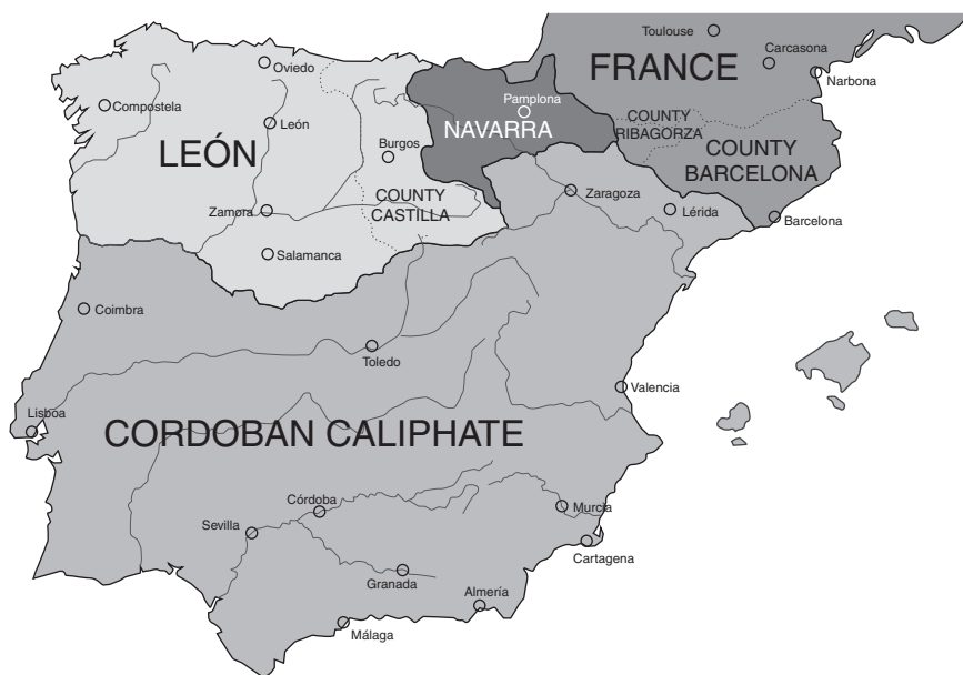
Map 3.1 The Cordoban Umayyad Caliphate