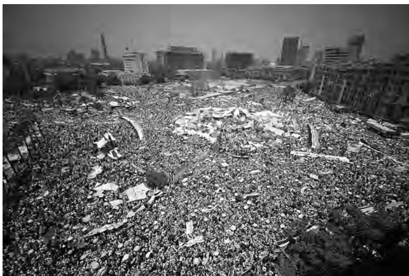
Figure 15.1 Joint protest of secularists and Islamists in Tahrir Square, Cairo, February 2011

A distinctive image of the 2011 Egyptian revolution that led to the ousting of President Hosni Mubarak is that of the chanting crowds in Tahrir Square: 'self-organized plural groups working collectively "on the ground" and laying claim to the present and the future of Egypt'. 20 'The people wants the fall of the regime' was the main slogan of the revolution. It embodied awareness of a newly found unity and a call for collective action that defeated long-established factionalisms. Indeed, a distinctive aspect of the initial (and short-lived) phase of the revolution was its cutting across the institutional, political, and psychological barriers that had long 'polarized Egypt's political terrain between more Islamically-oriented currents (most prominent among them, the Muslim Brotherhood) and secular-liberal ones'. 21 As Charles Hirschkind points out, '[c]ompeting visions of Egypt's future have long been divided along secular versus religious lines', 22 to the effect that the polarisation between secularists and Islamists has been