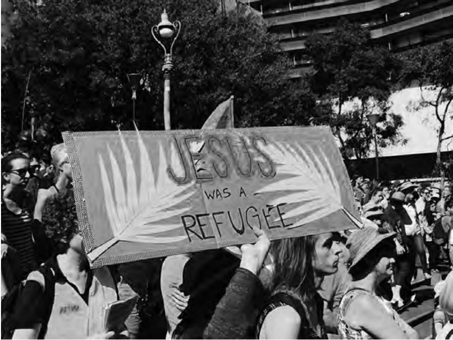
Figure 15.3 The 2015 Palm Sunday March for Justice for Refugees in Melbourne, Australia