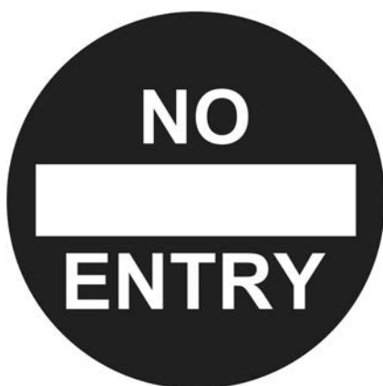
Figure 3.2 Polysemiotic verbal and nonverbal visual text