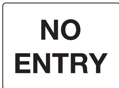
Figure 3.1 Monosemiotic verbal visual text