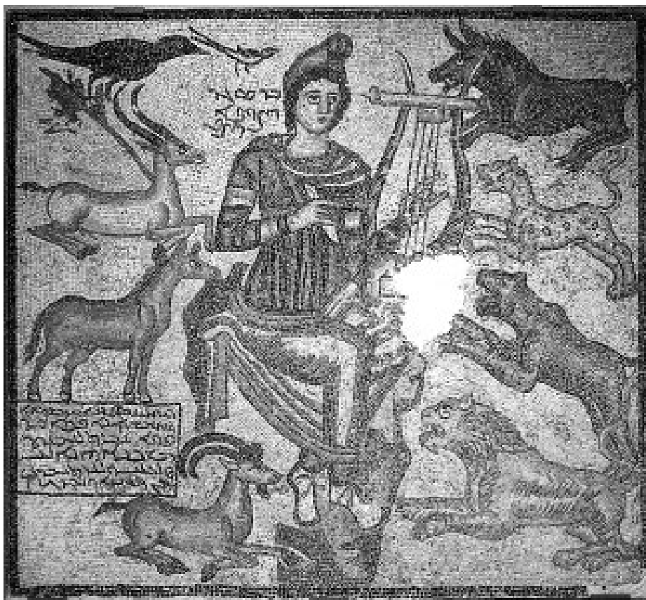
Figure 3.4 Orpheus taming the wild animals (mosaic from Edessa, AD 194)