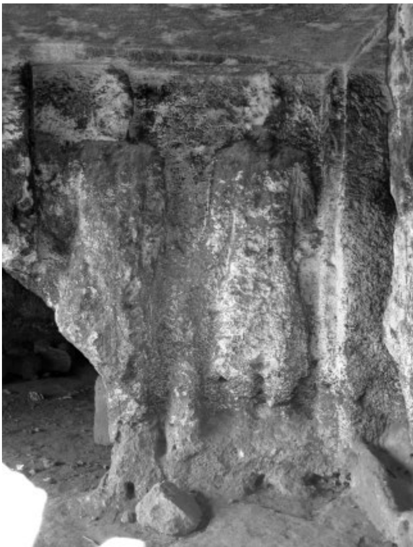
Figure 3.1 Inscription between two figures in Pognon's Cave, Sumatar