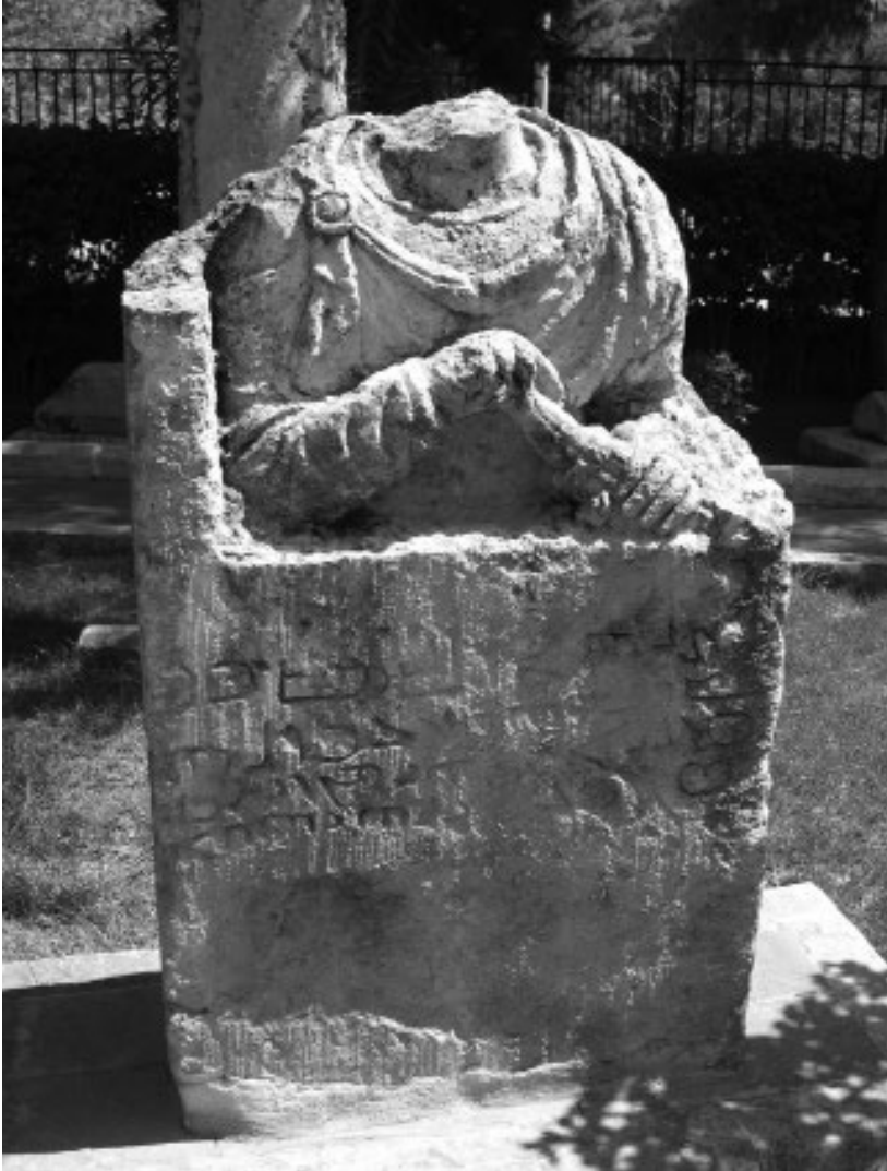
Figure 3.2 Inscription from Sumatar mentioning the god Sīn