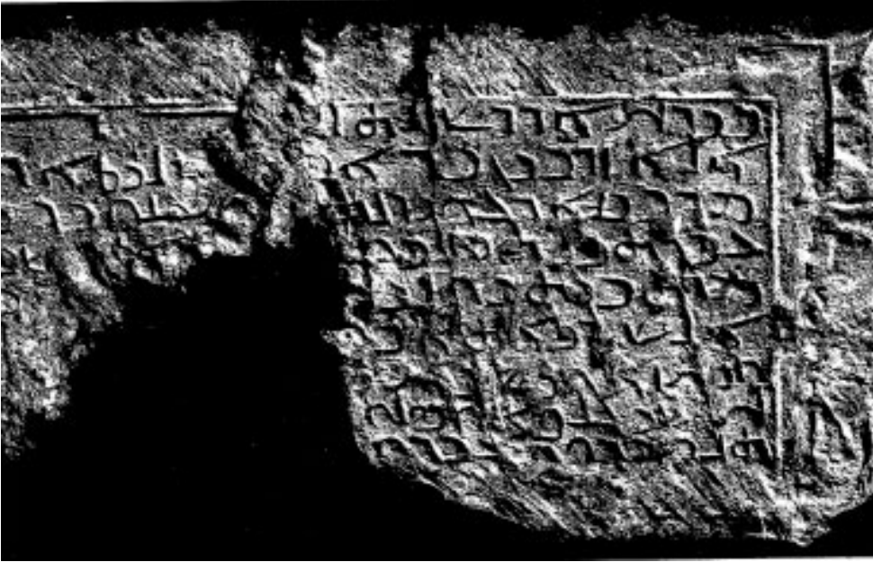
Figure 3.3 Funerary inscription for the governor of Birecik

king. The inscription is funerary, not religious, but the title budar again appears on the inscription and the implication is that this was an important religious office in the locality. Thus the Serrīn inscription too can be regarded as reflecting the power structures of the Edessan kingdom.